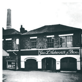
GL Ashworth and Bros' Mason's Ironstone Factory, c1950.