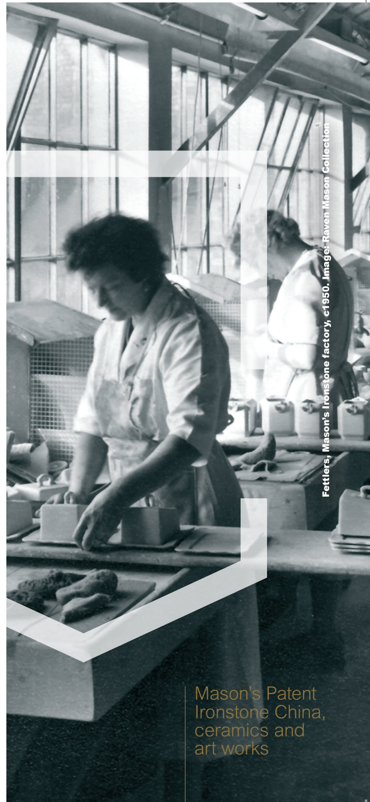
Fettlers, Mason's Ironstone factory, c1950.

The Raven Mason Collection is an Arts Council England Accredited Museum, no. 2259. The Raven Trust at Keele University is an independent, registered charity, no. 1018133. Donations to the Trust fund are always welcome.